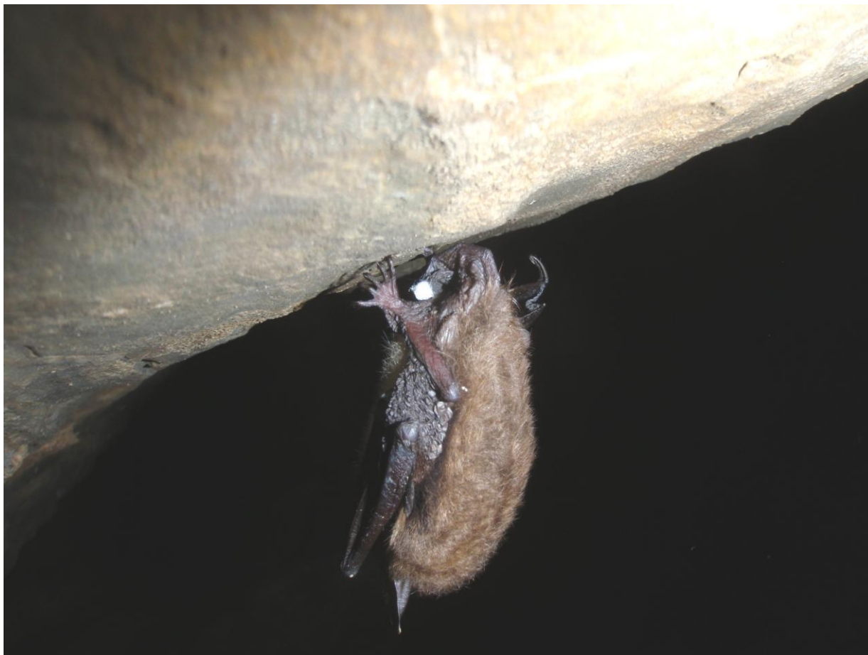
Little brown bat, Myotis lucifugus , with white fungus on tail, Breathing Cave, Bath County, Virginia.